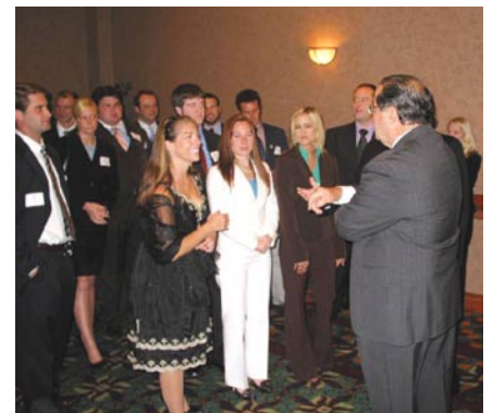
U.S. Supreme Court Justice, Antonin Scalia, interacts with Campbell Law students.

Nearly 20 Campbell School of Law students attended an October 26, 2007 awards program sponsored by the Jesse Helms Center where U.S. Supreme Court Associate Justice Antonin G. Scalia received the 2008 Nance Medal of Freedom, an annual award presented to a government official for public service. Prior to dinner, Campbell Law students had an opportunity to meet Justice Scalia and interact with him on a variety of issues. Most of the participating students were members of Campbell's chapter of The Federalist Society.